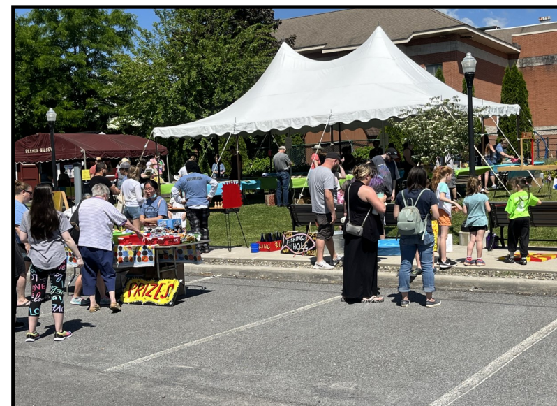
Friends of the Library Street Fair 2022

2021: Tax levy - $617,796 with remaining funds from donations and an appropriated fund balance.